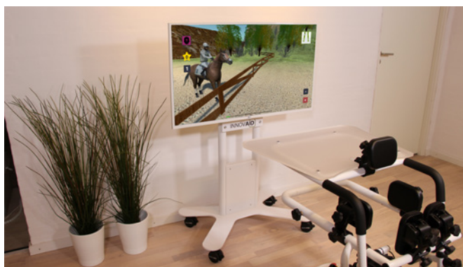
A short version that is adjustable from 110-150cm (from floor to center of screen), fits the Small / Medium system.