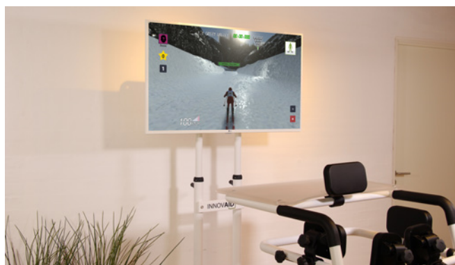
A tall version that is adjustable from 140-180cm (from floor to center of screen), fits the Large system.