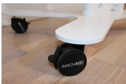
Four large revolving wheels.