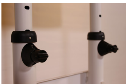
Simple height adjustment of screen.